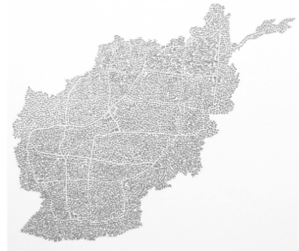
Suburbanistan 2002 David Opdyke

The new patriotism, having at the very first provided a rallying point for explosive emotions like defiance or revenge, also addresses something subtler, an urge to belong to something bigger than one's own concerns. Perhaps exhausted by the constant emphasis on overnight success that was so pervasive in the media not too long ago, the impulse to identify with something other than the stock market's latest numbers is a sincere urge that has been eagerly pounced upon by everyone from cutting edge fashion designers to airline industry giants trying to put a positive spin on post-September 11 air travel.